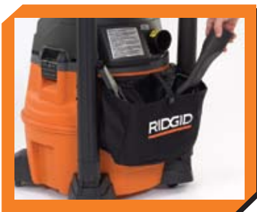
On-Board Accessory Storage