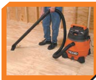
Dry Pick-up - Workshop, Garage etc.