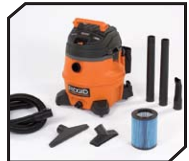
Vac with Accessories & Filter