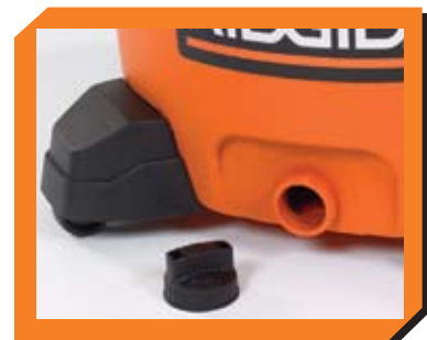
Large Drain for Emptying Water