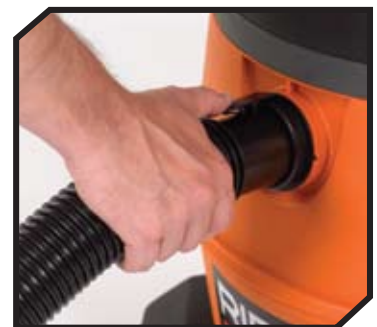
Tug-A-Long® Locking hose