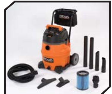
Vac with Accessories & Filter