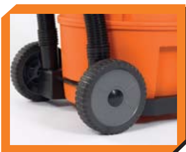
Rear Wheels-Rough Terrain Mobility