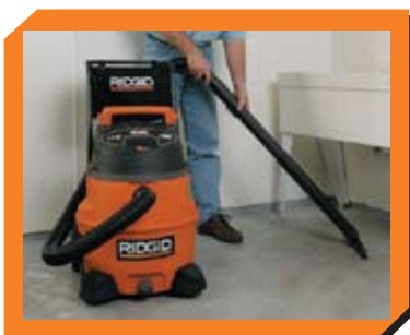
Wet Pick-up - Basements, etc.