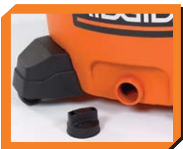
Large Drain for Emptying Water