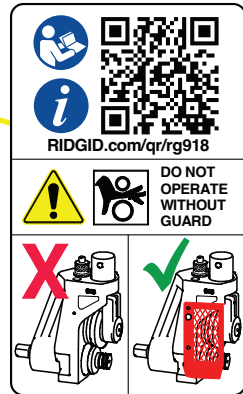
Figure 2 – 918 Guard/QR Decal (Cat. # 80228)