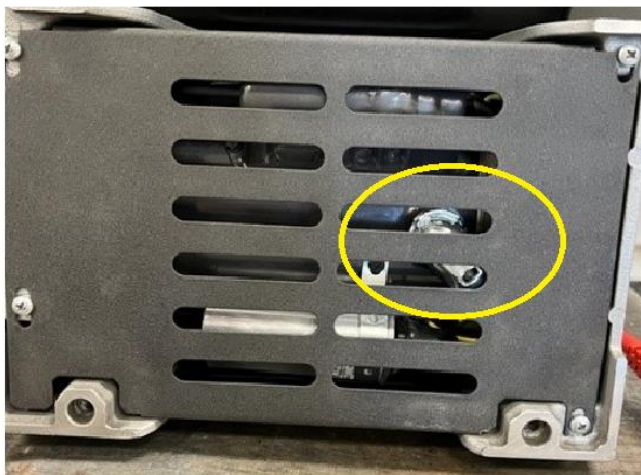
Figure 3: Example of unaffected unit with 90° motor strain relief present (A) and/or red colored motor wires present (B)