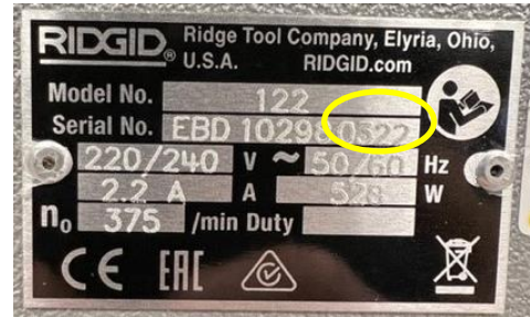
Figure 2: example 122 and 122XL serial plate date code location is last four digits of serial number corresponding to MMY, here 0322 = March 2022